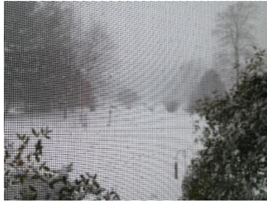
Shaw Drive during Blizzard of 2016

the efforts required to shovel snow in the blizzard of 2016. If you see or know of someone who can use a helping hand, please pitch in and help. Let's all join together and work hard to keep Lake Acres a desirable and sought after neighborhood.